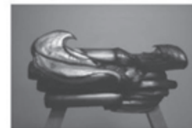
"Saddlebird" by Rhea Vedro

New Music. New Art. Come Celebrate the Now!