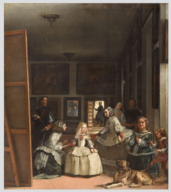
Diego Velázquez: Las Meninas (1686)