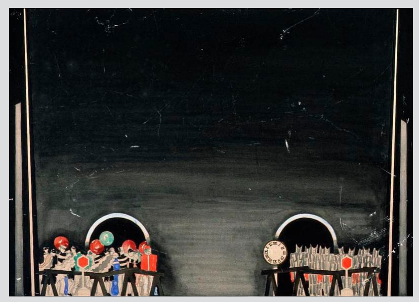
Robert Edmond Jones: Scene design for the Transition from Work to Play, scene 3, and the Return from Play to Work, scene 5, in Skyscrapers (ca. 1926)