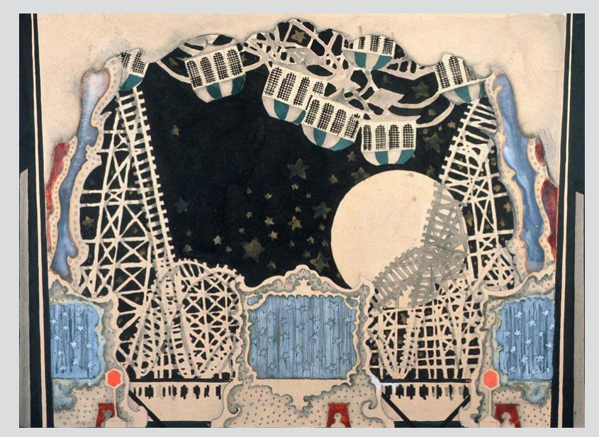
Robert Edmond Jones: Scene design for Coney Island, scene 4, in Skyscrapers (ca. 1926)