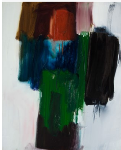
Cover art: Larry Rivers (1923–2002). Flying American , 1959–1960. Oil on canvas, 50 1 / 4 × 40 3 / 4 in. (127.6 × 103.5cm). Collection of the McNay Art Museum, Gift of the Estate of Tom Slick (1973.28).

This recording was made possible in part by the McFeely-Rogers Foundation and an anonymous donor.