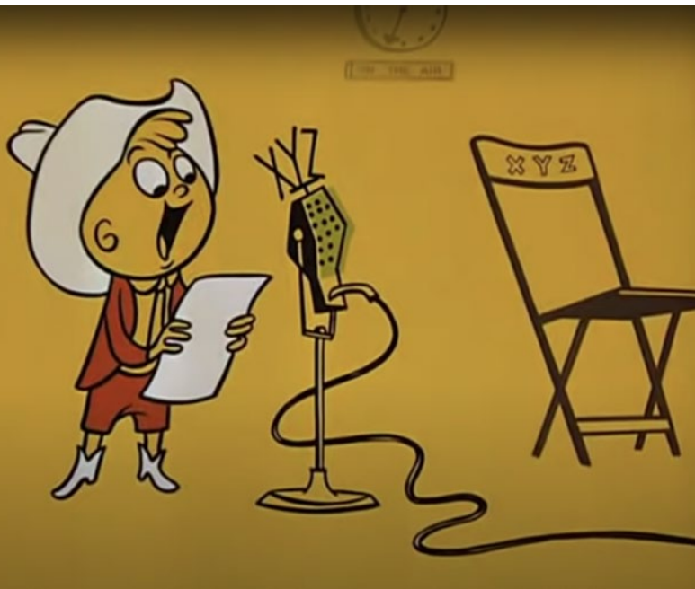
Still from Gerald McBoing Boing