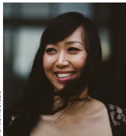
HOT METAL STUDIO