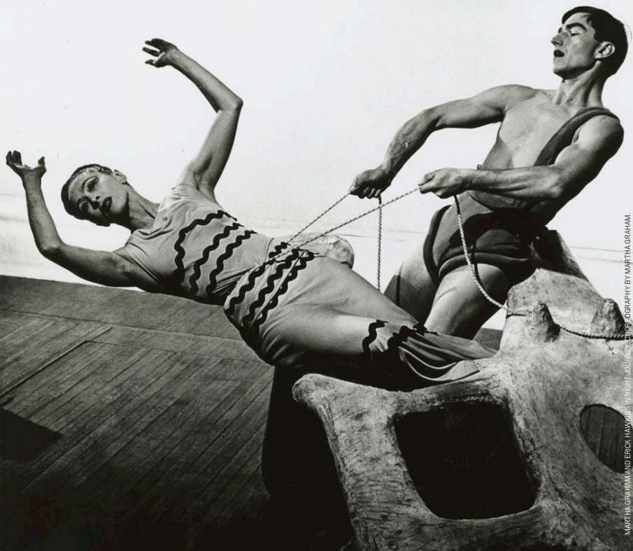
MARTHA GRAHAM AND ERICK HAWKINS IN NIGHT JOURNEY, CHOREOGRAPHY BY MARTHA GRAHAM.